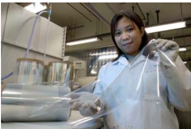
Flexible barrier substrates enable greater cost savings in manufacturing such as in allowing roll-to-roll processing.

Current barriers have a series of alternating polymer and metal oxide layers that make up the plastic. This staggers adjacent ‘pinholes’, natural defects in the layers, thus slowing the passage of moisture and air through the ‘pinholes’.