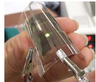
IMRE's flexible substrates have higher barrier properties compared to existing market technologies thus potentially enhancing the lifetime of existing thin film photovoltaic solar cells, inorganic EL displays and other flexible electronics products.

IMRE has successfully resolved the ‘pore effect issue’ in multi-layered barrier stacks and developed ultra high barrier plastic substrates (barrier properties < 10^{-6} g/m 2 /day) for high barrier applications. Our calcium test results show that there is no calcium oxidation up to 2300hrs at 60°C and 90% relative humidity.